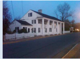
One of Front Royal's Founding Fathers Built his house to honor the home Of one of America's Presidents Can you guess which one?