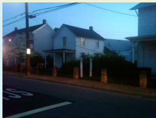
Cross the intersection plus one abode Built a big one to rent with dollars earned, seeds she sowed. Genteel, indentured, humble, her house meek at best Sweet, faithful servant at Prospect Hill has found her rest.