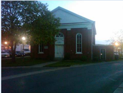
A Greek Revival Church ahead The oldest in town It once served as our courthouse During the Civil War.