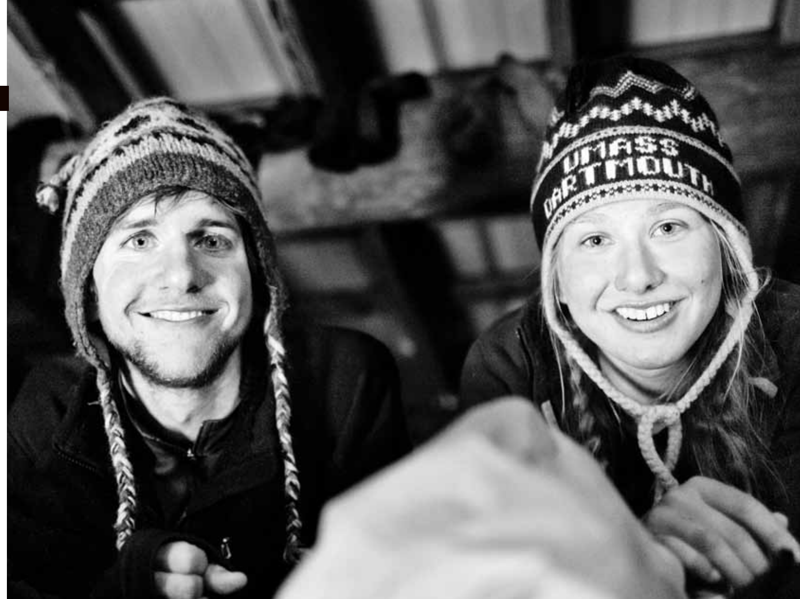
CLOCKWISE FROM TOP: "BRANCH" AND "APPLESEED," PECKS CORNER SHELTER, NORTH CAROLINA; "TENDERFOOT" AND "SNOW WHITE"; "HOT LIPS" AND "ROCKER" AT HIKERS WELCOME HOSTEL, GLENCLIFF, NEW HAMPSHIRE.