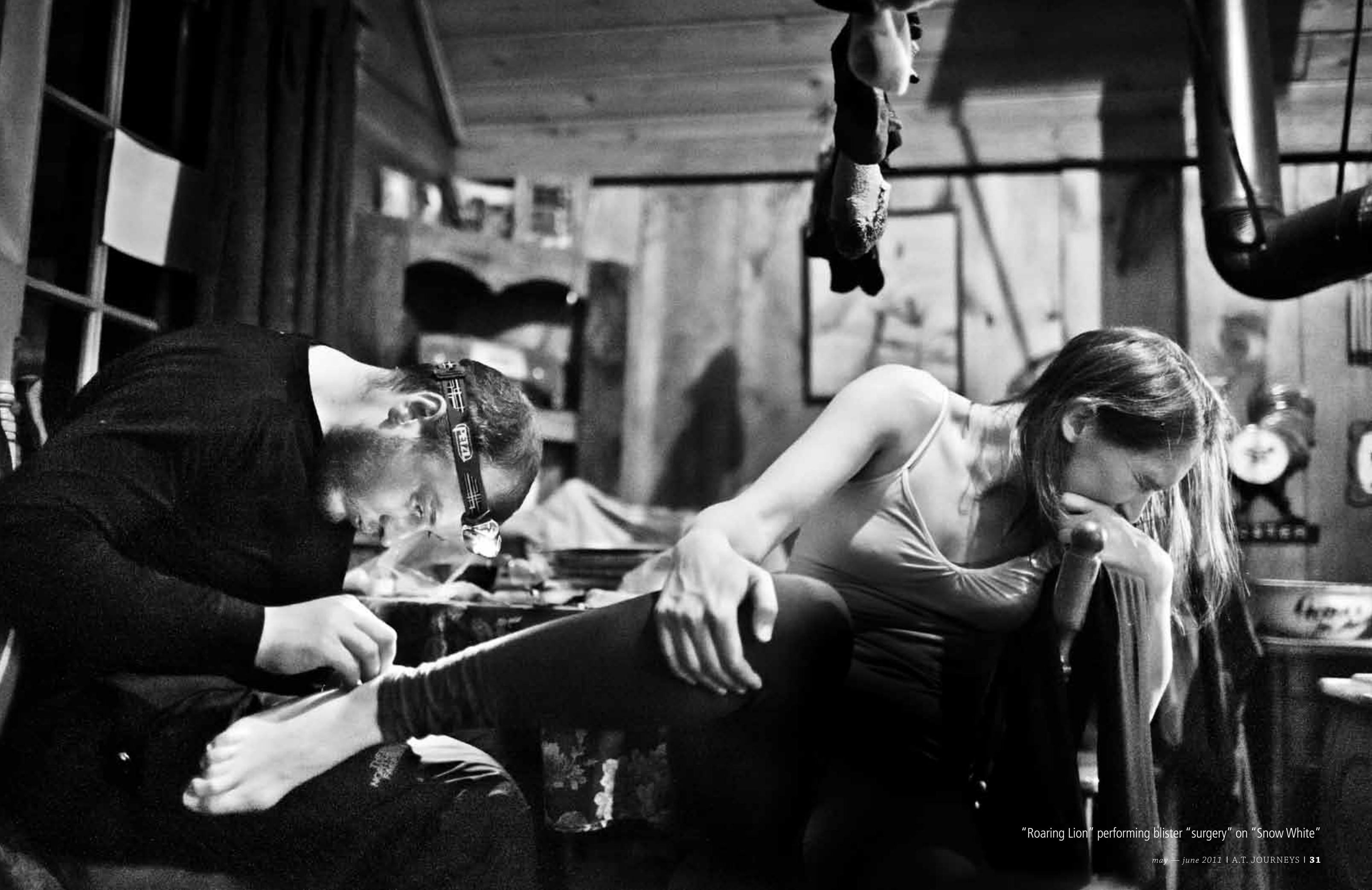
"Roaring Lion" performing blister "surgery" on "Snow White"