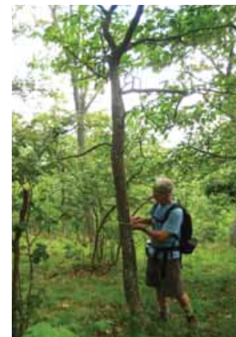
BY MARK GATEWOOD ILLUSTRATION BY BETTY GATEWOOD

There are several other species of chestnut worldwide, in