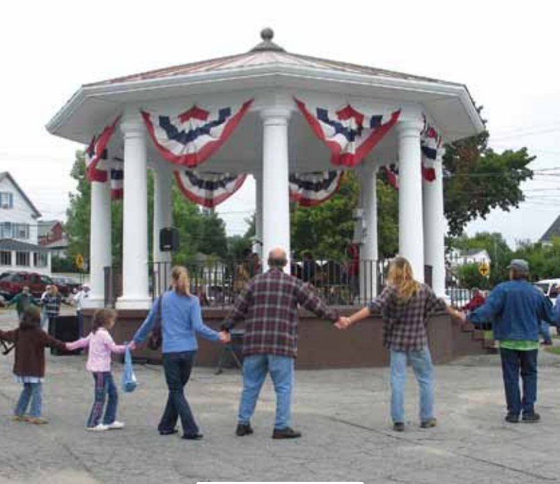
TRAILS END FESTIVAL