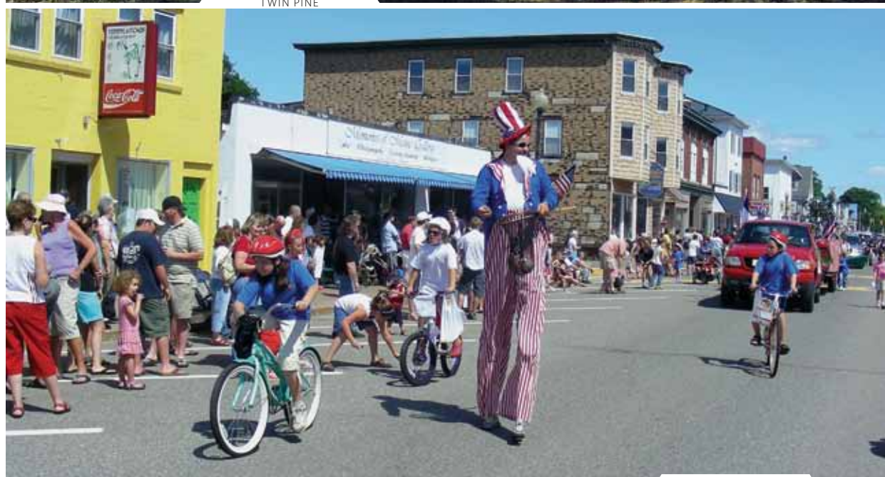
FOURTH OF JULY